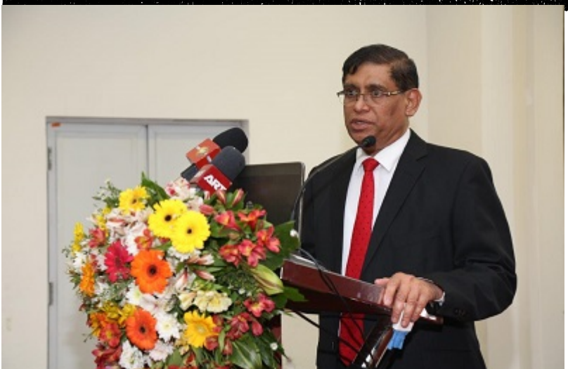
Shapiti dhai i janniya shabayah qaya ng baya a maka gu ng manaman ana dhin hin i gin sayab tan gapha fan si bar tana ar cin