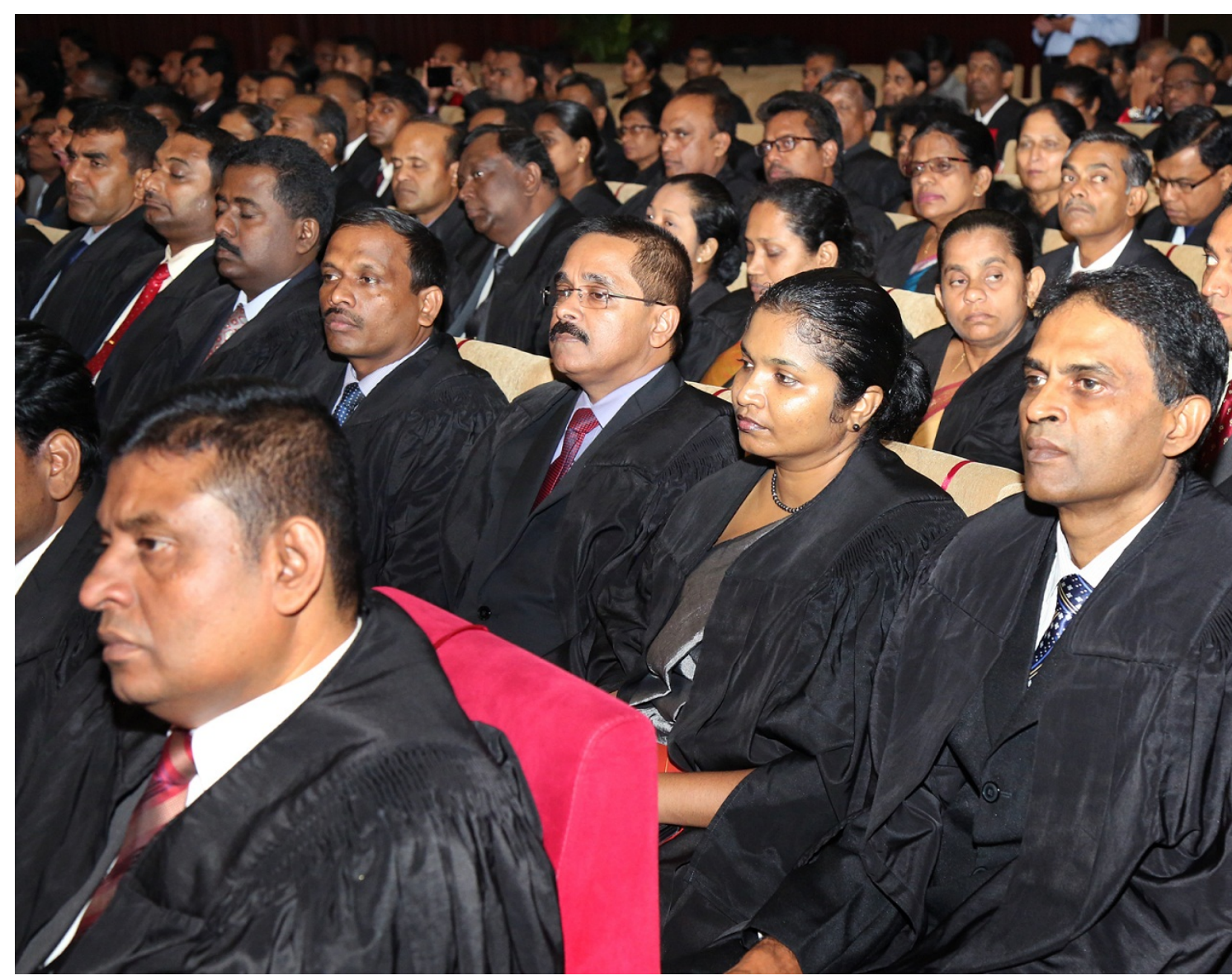
A section of the recipients who were awarded the CPFA qualification.

Pavithra ஆல் எழுதப்பட்டது Monday, 05 November 2018 08:07 - Last Updated Monday, 05 November 2018 08:29