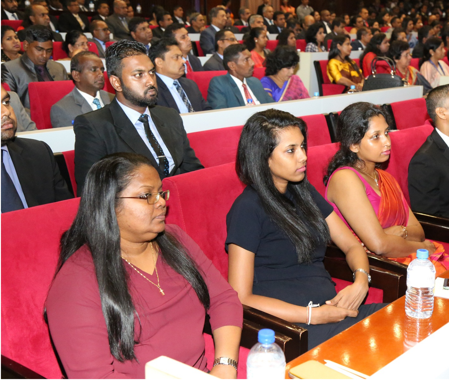
A section of the audience at the inauguration of the 39th National Conference