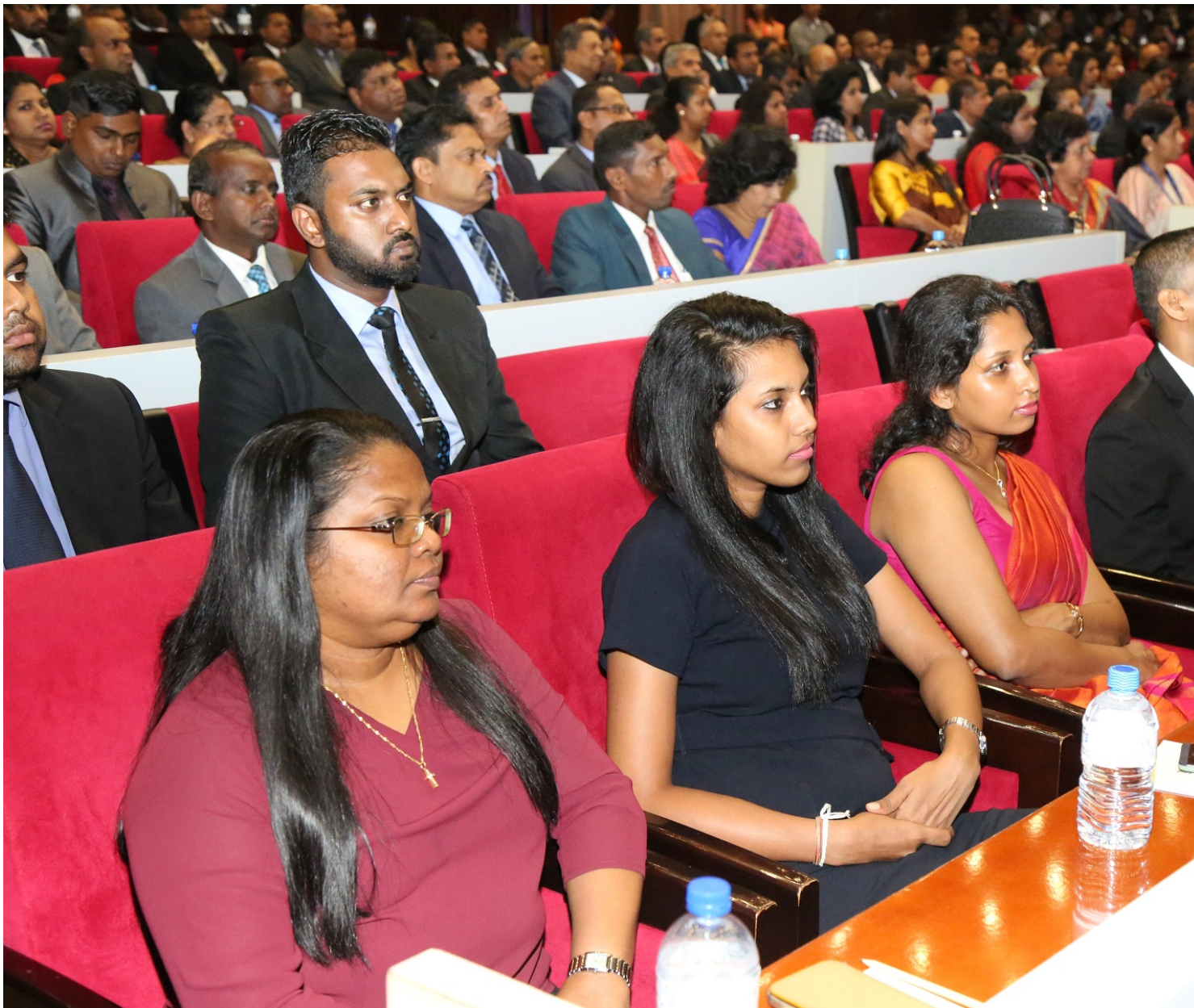
A section of the audience at the inauguration of the 39th National Conference

Wednesday, 10 October 2018 07:43 - Last Updated Tuesday, 16 October 2018 05:26