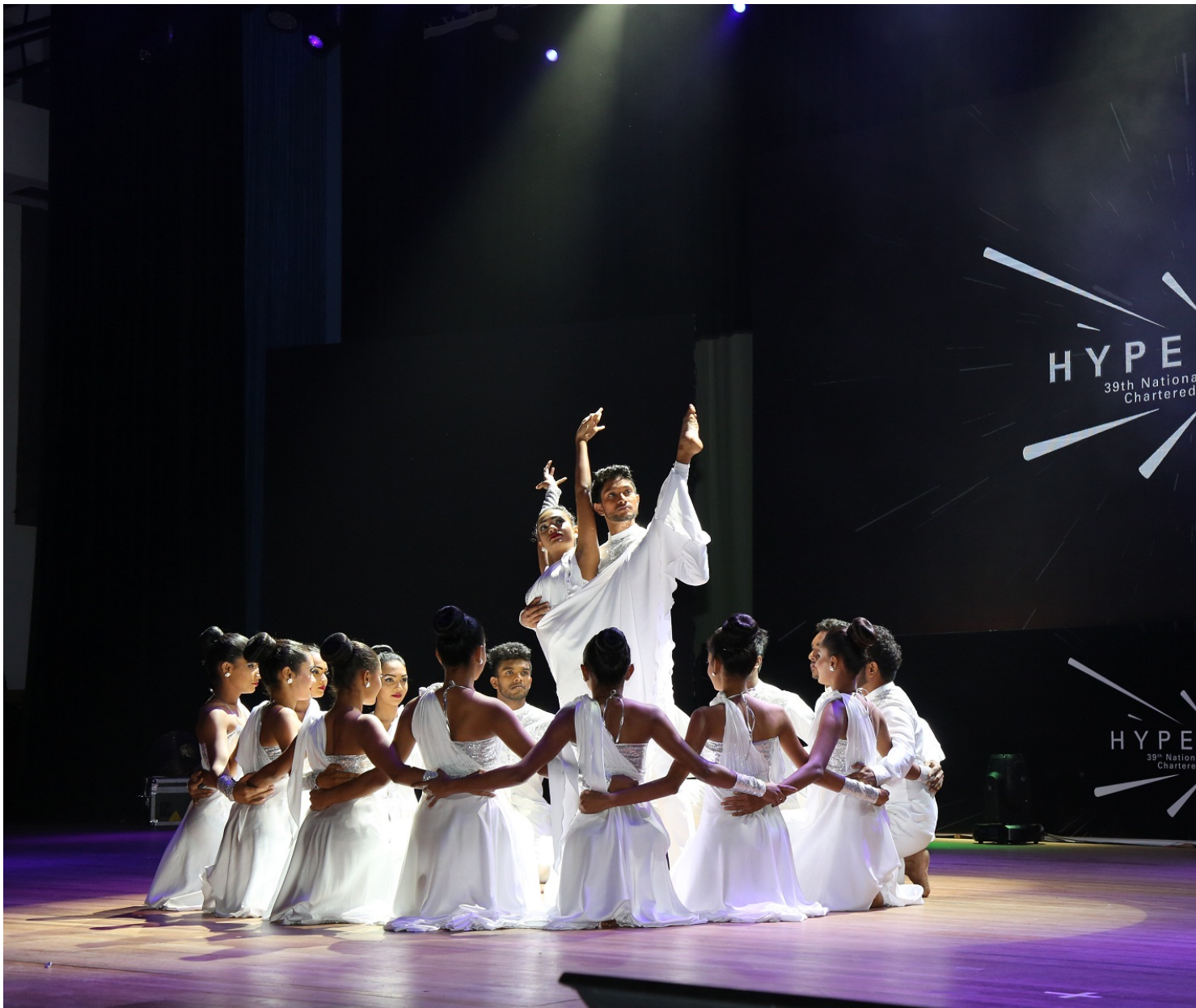
An entertainment act describing the theme of the conference 'Hyperleap'

Wednesday, 10 October 2018 07:43 - Last Updated Tuesday, 16 October 2018 05:26