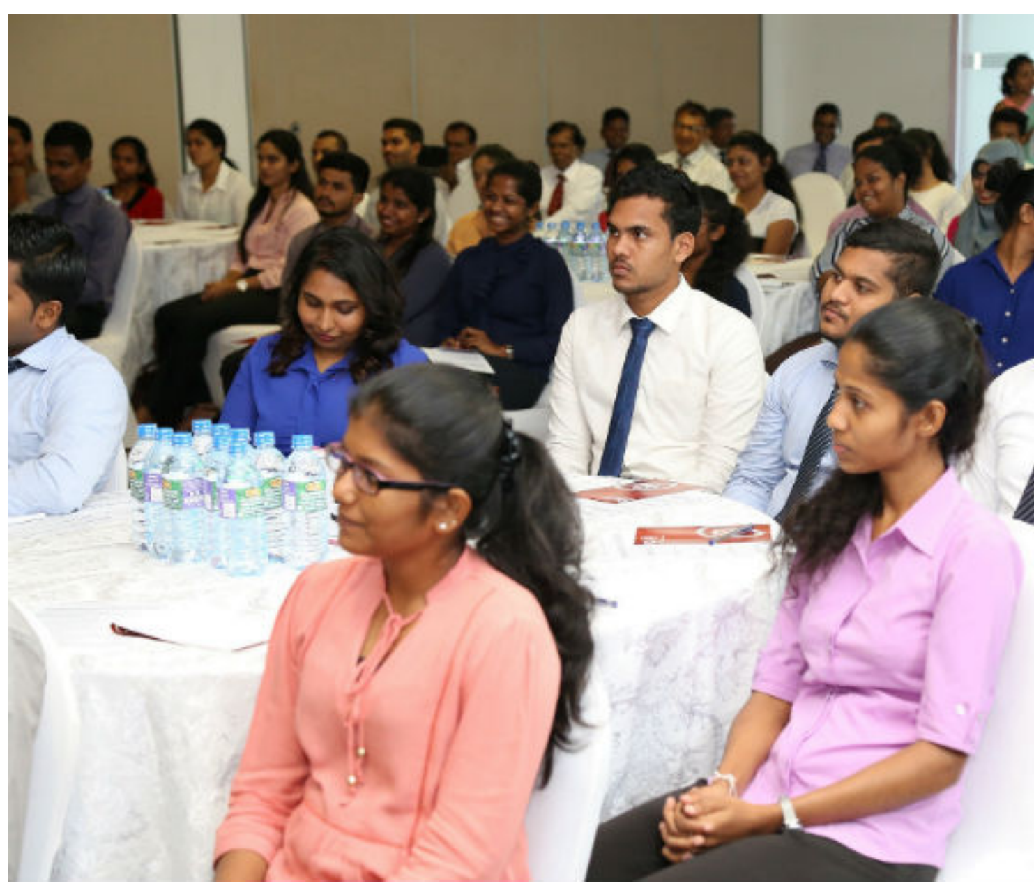
A section of the participants at the induction programme.