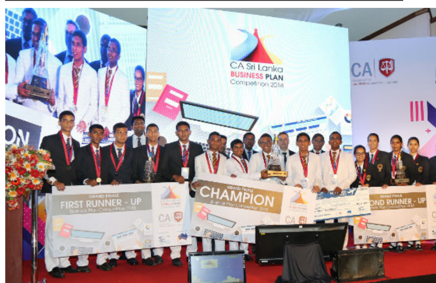
Champions of the 2018 CA Sri Lanka Business Plan Competition Ananda College, flanked by first runi