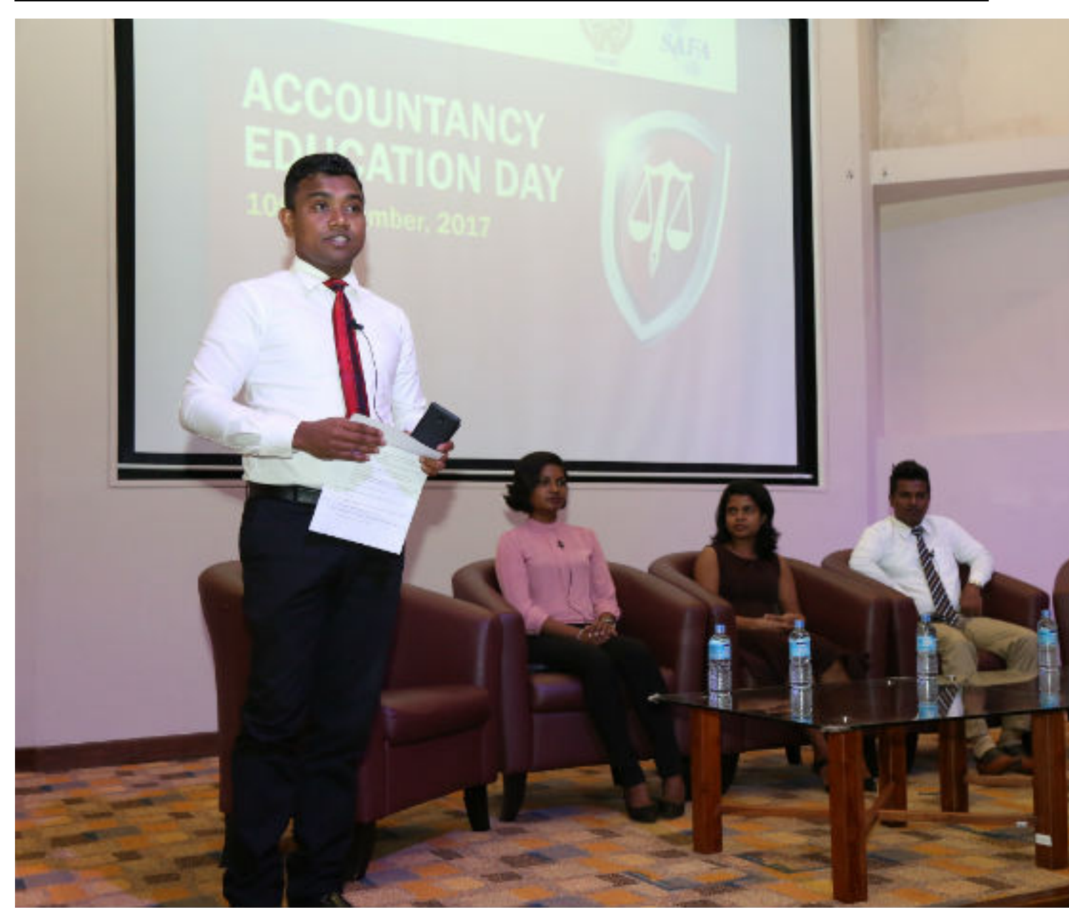
A panel discussion with CA students

ලියන ලද්ද ේ Vigashini 2017 නගවැම්බර් 13 වනෙි සදුදා, 04:49 -