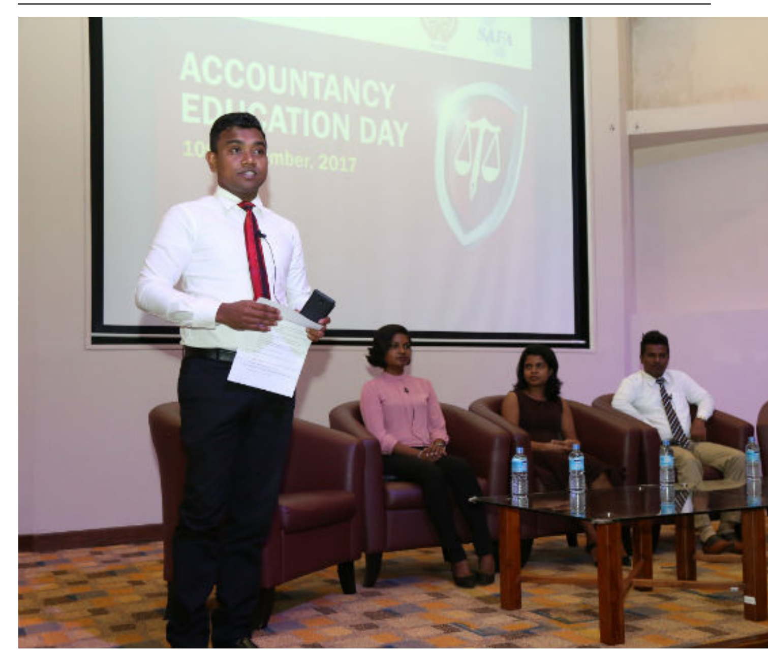
A panel discussion with CA students