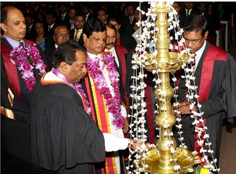
A total of 545 students recently graduated as Certified Business Accountants (CBA) at the 2014 CBA convocation of the Institute