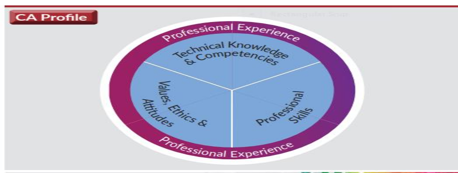
Figure 1: CA Profile

Professional experience provides students an opportunity to experience the attributes of professional skills, values, ethics and attitudes together with technical knowledge and competencies.